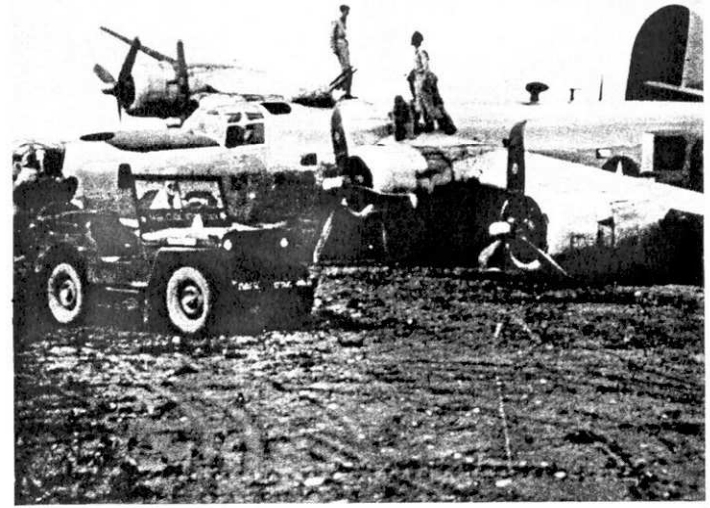
B-24 FROM THE 827TH SQ. CRASH LANDS RETURNING FROM A MISSION. ITALY 1944.