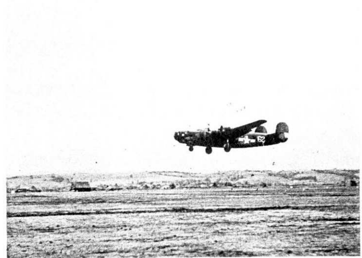
A B-24 FROM THE 451ST BOMB GROUP LANDS AT TORRETТА. THE 451ST ALONG WITH THE 461ST AND 484TH BOMB GROUPS MADE UP THE 49TH WING OF THE 15TH AIR FORCE. THE 451ST WAS BASED AT CASTELLUCCIO DUE WEST OF CERIGNOLA.