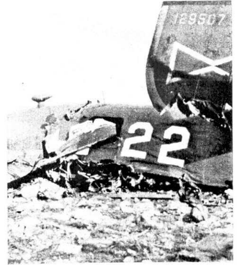
A CONSOLIDATED (FT. WORTH) BUILT B-24-H OF THE 824TH SQUADRON LIES BROKEN AFTER A CRASH LANDING AT TORRETТА (SUMMER 1944?)

Back row of picture immigrant and master crew