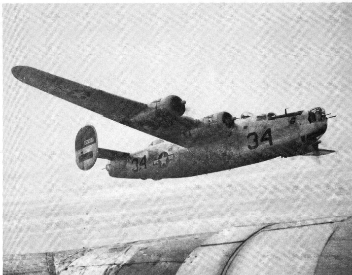
Ship #34 flown by Lt Vahl Vladyka, now an attorney in Texas. 765 Sq