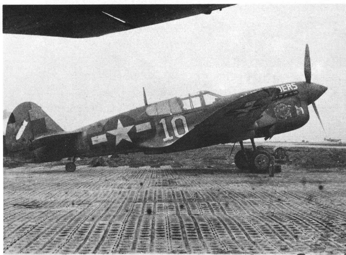
P-40 F Flown by Col Glantzberg during mission assembly after take off. No other pilots were allowed to fly it under penalty of court martial.