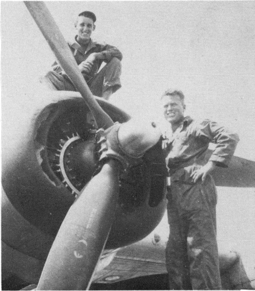
Crew Chiefs ship 69