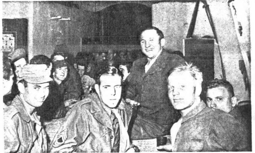
461st BG personnel at Snuffy's Birthday party