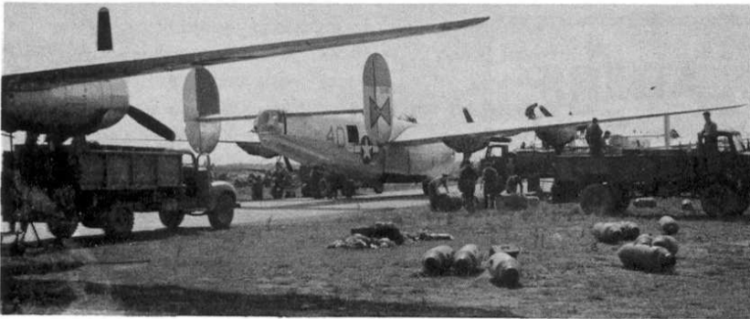
484th BG