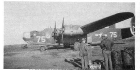
Generator Joe 75 After being converted to a squadron supply ship Hastings, FL

War weary after over 100 combat missions it was converted to R & R and cargo aircraft.