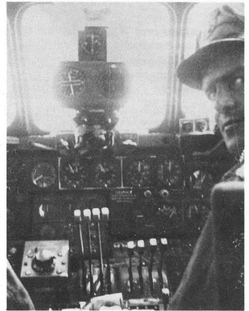
Co-Pilot of Usherson's crew. Judging from the position of the throttles, manifold pressure and RPM gages the engines are set for climb power.