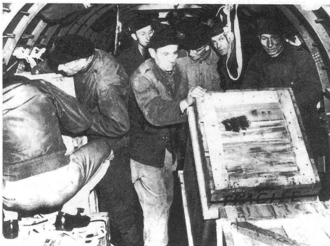
German loaders (above) wrestle cases of supplies into position aboard a C-47. An air crew member (left) checks the placement. Venerable C-47s carried freight in the airlift early days, until supplanted by the C-54 as the main lifter.

able airlift structure. He appointed Brig.Gen. Joseph Smith, commander of the installation at Wiesbaden, as the Berlin Airlift Task Force Commander, but he was to perform these duties in addition to his other tasks. He did not even know of his appointment until the airlift had commenced, being told of it over lunch on Sunday, 27 June 1948. Smith was responsible for the designation of the airlift as Operation Vittles because, as he said, "We're hauling grub." The British chose to call their part of the airlift Operation Plane Fare, a pun (17) that must have given airlifters around the world a chuckle. At best, they planned that the operation could be sustained for 45 days. American crews flew the first formal missions on Saturday, 26 June, airlifting 80 tons of milk, flour, medicine, and other high priority cargo to the city on 32 C-47 flights. By Monday, the sustaining airlift was in full swing, but General Clay was not optimistic. He told Department of Defense officials that "with this airlift, we should be able to bring in 600 or 700 tons a day. While 2,000 tons a day is required in normal foods, 600 tons a day (utilizing dried foods to the maximum extent) will substantially increase the morale of the German people and will unquestionably seriously disturb the Soviet blockade." Even so, this would not provide coal for heat, raw material for factories, or fuel for engines.(18)