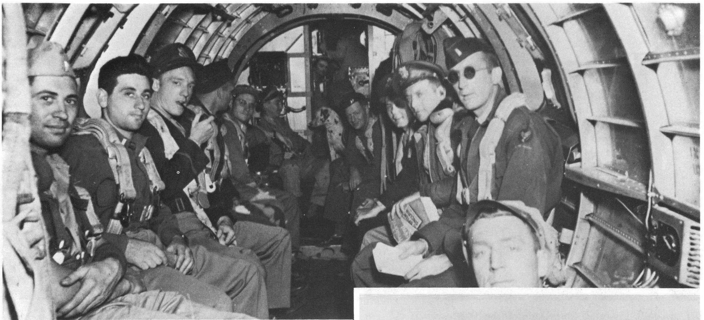
B-17 interior redesign for Project Green passengers.

and to compensate for the dismal environment at Istres, was packed with variety. The daily bulletins announced countless dances, USO shows, movies, daily transportation to the Riviera beaches and Marseilles, and quotas of enlisted men selected to stay in leased villas near the seaside resort of Sausset. The highlight of recreational activities was the daily liberty run. The B-17s transported group personnel, on a daily basis, to either Rome, Paris or London. A disturbingly high price was paid for these activities, particularly for the daily runs to Marseilles, for there was an alarming increase in the rate of venereal disease among the men. (23)