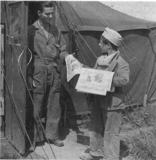
Delivery of Stars & Stripes, 825 Squadron (40-2)