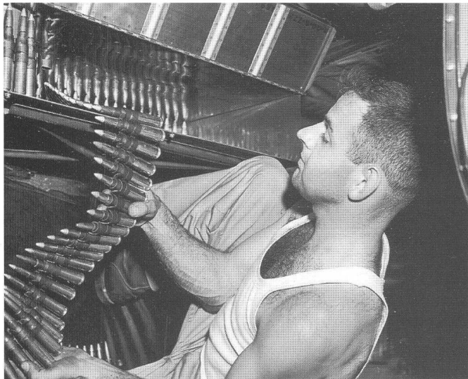
Loading waist gun ammunition can, Every fifth round was a tracer shell as indicated by the color of the bullet tip.