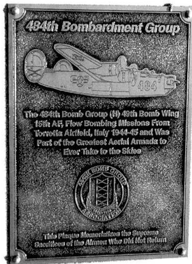
The 484th's Plaque as installed in Arlington National Cemetery