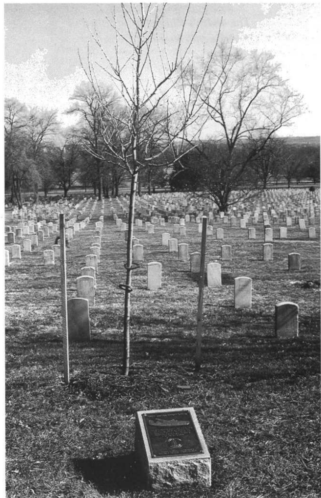
484th Plaque and Tree in Arlington National Cemetery, Spot 33.