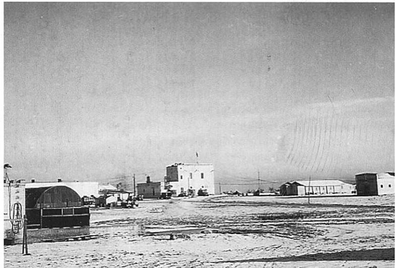
484th Bomb Group Headquarters area near the north end of the runways at Torretta, The 825 Squadron area was also located near here.

The 484th Bomb Group Association 1122 Ysabel St. Redondo Beach, CA 90277-4453