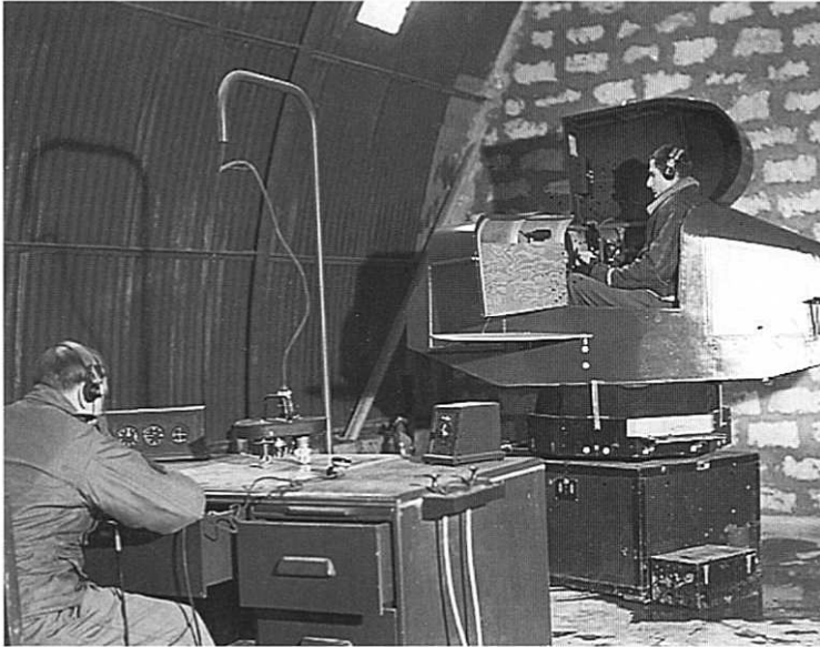
A Link trainer in operation at Torretta, Fall 1944.