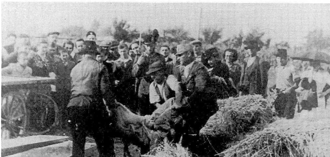
Loading one of the casualties into a coffin