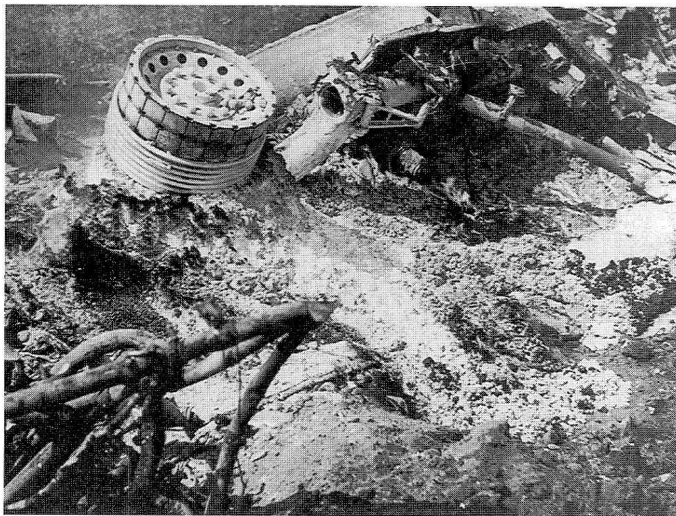
Part of a Main wheel showing the brake blocks