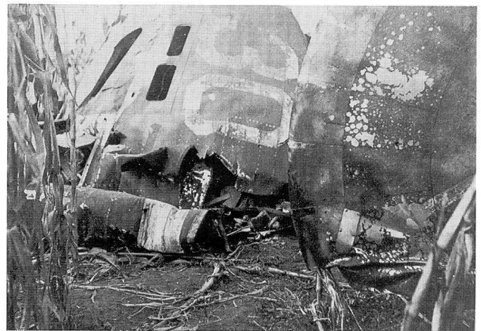
Tail section of No #30 42-52438