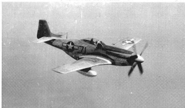
P-51 from the 332nd Fighter Group (Tuskegee Airmen) identified by the all red tail. See page 14