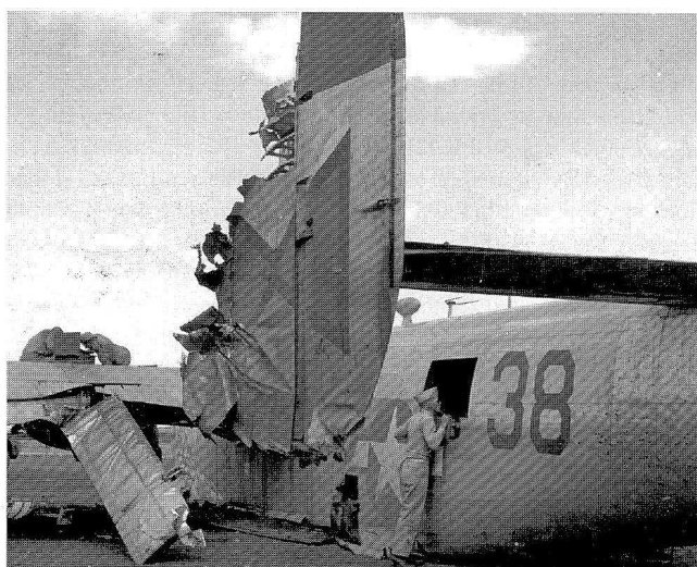
B-24 42- 51835-38 damaged beyond repair, see page 34